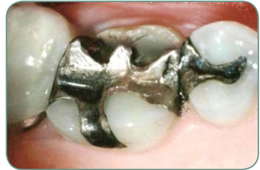
Expansion causes tooth to fracture