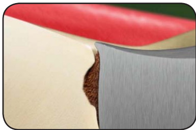
Bacteria enters between tooth and filling

Replacing a failing amalgam filling with a new restoration can prevent more decay from developing and keep your mouth healthy.