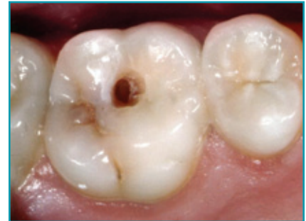
Cavities need to be filled