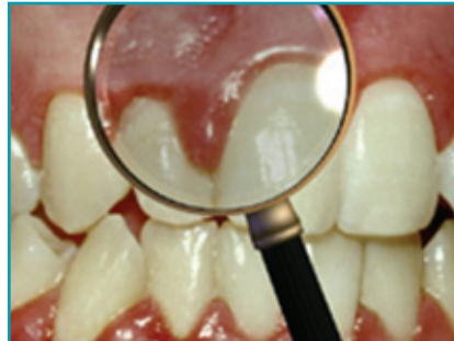
Signs of periodontal disease